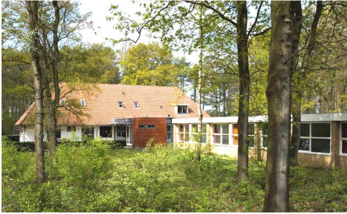
Nieuw Allardsoog ( www.nieuw-allardsoog.nl )

Sunday July the 22nd (13:00 pm) till Saturday July the 28th (15:00 pm) 2012.